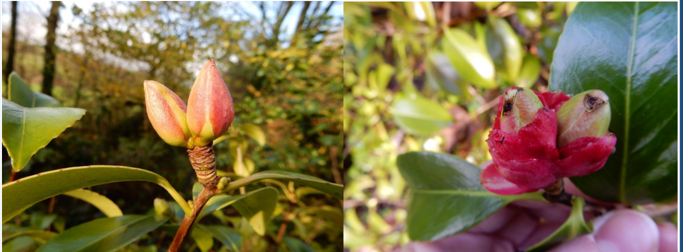
Above left: double budding. Above right: malformed opening of double buds. Below: malformed single flower with unopened centre.

While it is by no means in full flower, it has at least 6 flowers out now, and a couple of mis-formed flowers have gone over. However, the fact of its flowering at all in autumn is not my focus, but rather the style of these flowers. At least 4 flowers have double buds. Photographs tell the story best and they show the different growth stages of these double buds and how they evolve and flower as malformed flowers with an unopened centre. I also have one large complete flower out but exhibiting an unopened centre, and not looking like its normal self. I believe that this kind of malformation of buds is more likely to occur with a formal double flower than any other.